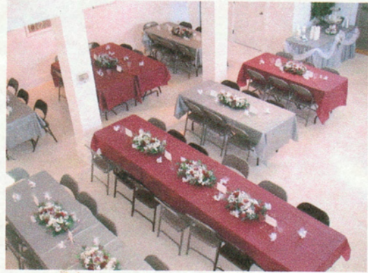
Building Capacity is rated at 190