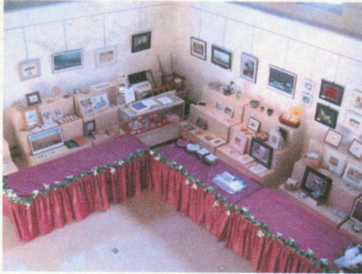
The gift gallery is perfect for a buffet