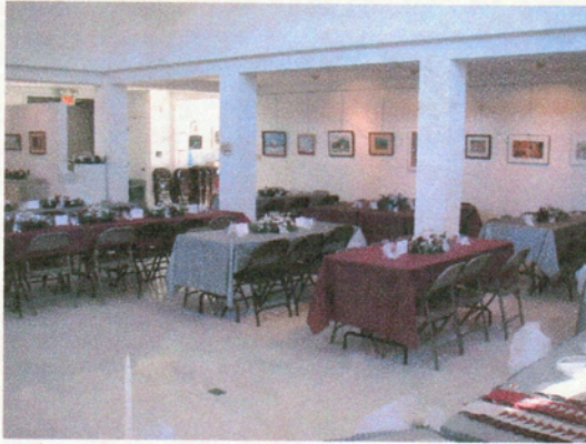
This party seated 70 in the main gallery